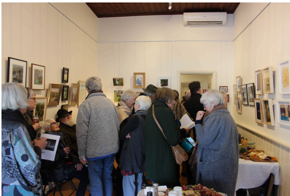
The crowd at a MANet opening